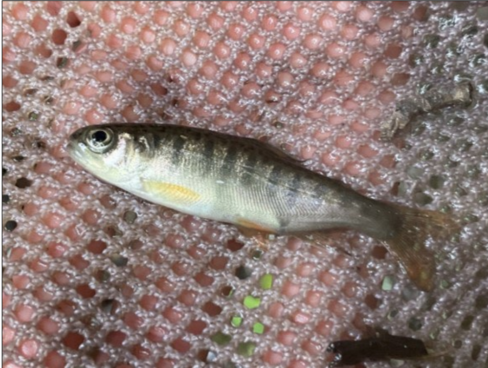
Figure 1.—Juvenile coho salmon captured at waypoint 1463.