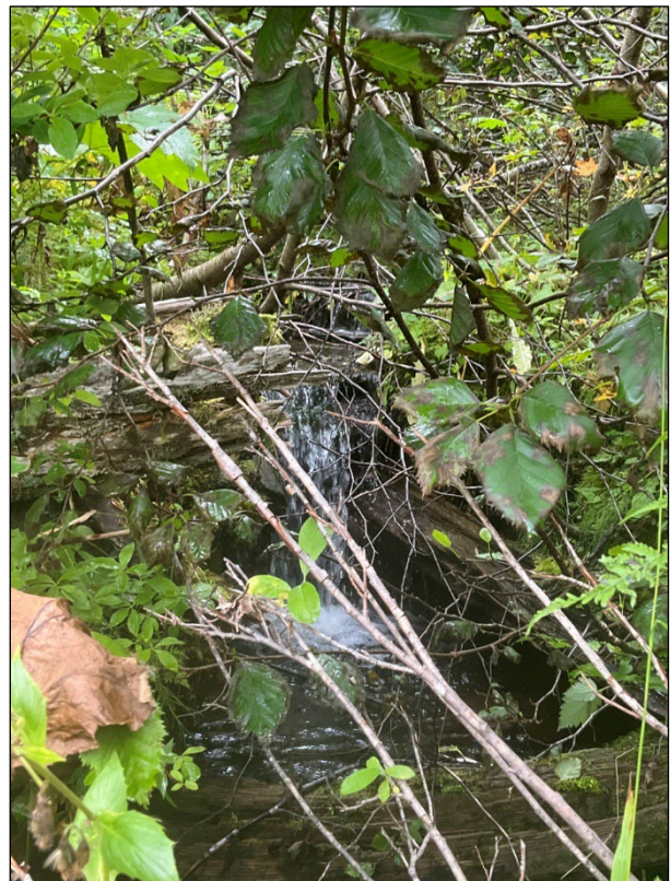
Figure 3.—Log jam falls at waypoint 1461.