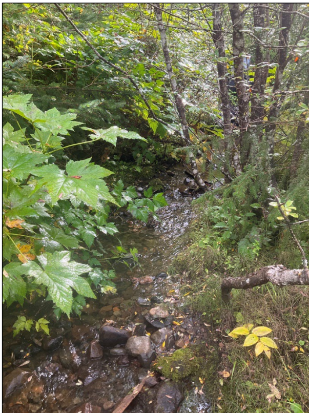
Figure 2.—Channel at waypoint 1460.